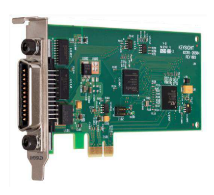
82351B with standard profile bracket