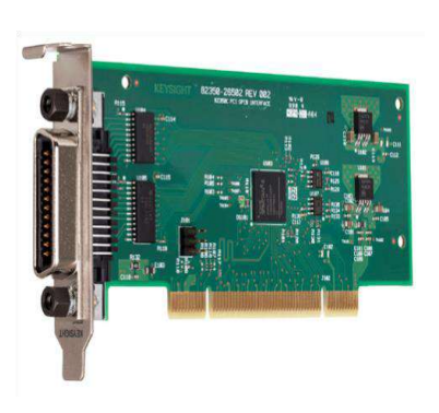
82350C with low-profile bracket